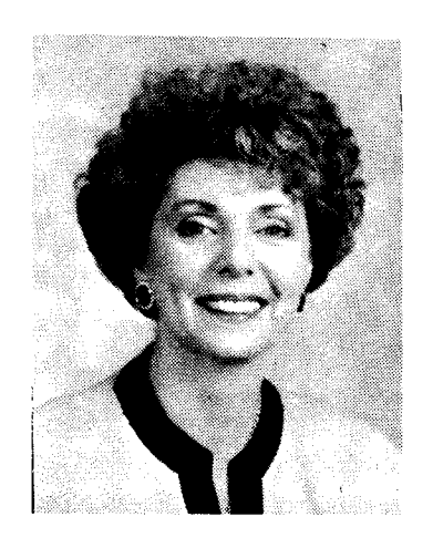
Properties of Distinction, Inc. 1010 N. Glebe Road, Suite #160

You can depend on Bobbi to cater to <u>all</u> your personal real estate needs.