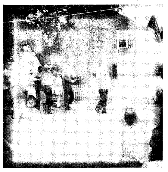
The incomparable Barcroft Marching Band and its veteran color guard, under the direction of Jack Turner (trumpet and sombrero, center).

FOR SALE Solid wood wall unit with fold-down desk, $150. Compact refrigerator, perfect for dorm room, $40. Call Jim or Kathy, 892-6458.