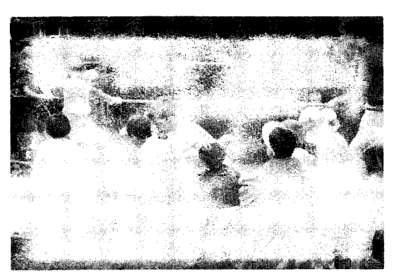
The spirited tug of war. Losers fell into the pool!

Bicyclists, joggers, and pedestrians are undoubtedly safer crossing at the bike trail.