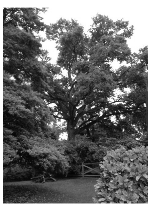
This black gum tree on 6th Street has been designated as a "Notable Tree" by Arlington County.

lington. You can find this list online at