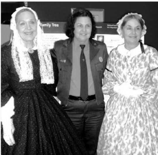
Barcroft Volunteers at Lee Mansion.