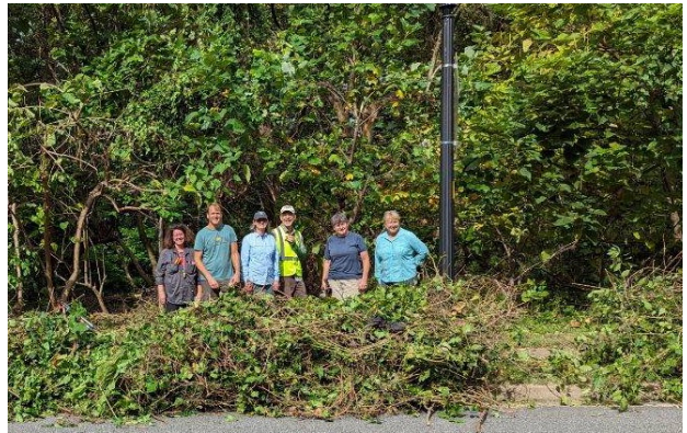
Porcelain berry vines removed on Sept. 30th by our crew.