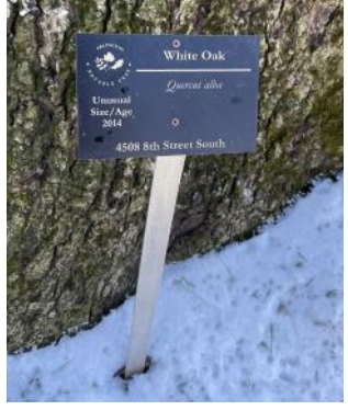
One of Arlington County's "Notable Trees" located in Barcroft.

For Arbor Day 2022 (April 29) take a walk, enjoy the dappled light, huge canopies, and bright spring green leaves, and admire Barcrofts Notable trees. And if you run into any home-