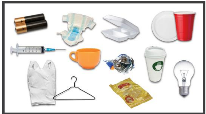
The items shown above are not recyclable and should be put in the black trash bins.