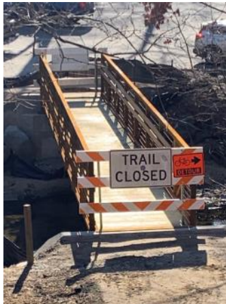
The bridge over Four Mile Run by the dog park that was washed out in a 2019 flood is being replaced.

If you'd like to be part of a potential solution to remediate stormwater flooding and erosion problems in this part of the Four Mile Run watershed, please contact Deborah Wood, at president@bscl.org or 703-892-1243. •