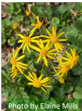
Golden Ragwort is a cheerful, evergreen native groundcover.

choosing combinations that will result in blooms over the course of the season. In a sunny areas, if you are guided by the spring, summer and fall packages on the Plant NOVA Natives website ( https://www.plantnovanatives.org/ ), the result will be a stunning combination of well-behaved plants that will attract butterflies throughout the growing season. Suggestions for shady or wet areas are included, as are ornamental grasses. You can also find locations of garden centers that stock native plants. ●