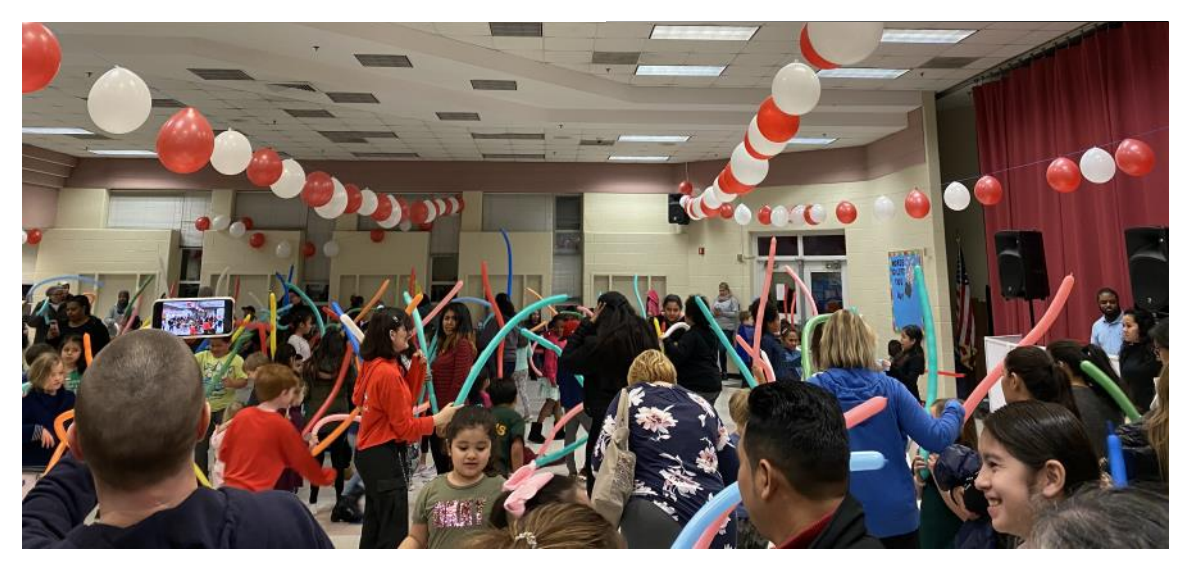
A Friendship Party was held at Barcroft Elementary School in early February.