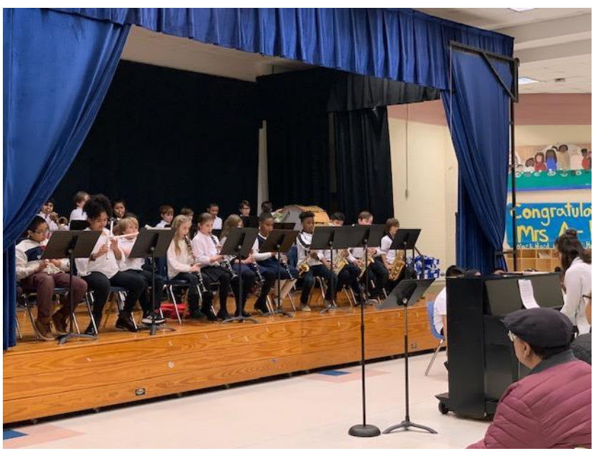
Fourth graders presenting their winter music concert.

The fourth graders had a busy second week back at school, with a fun field trip to visit the NHL Black Hockey History mobile museum, followed two days later by their winter music concert.