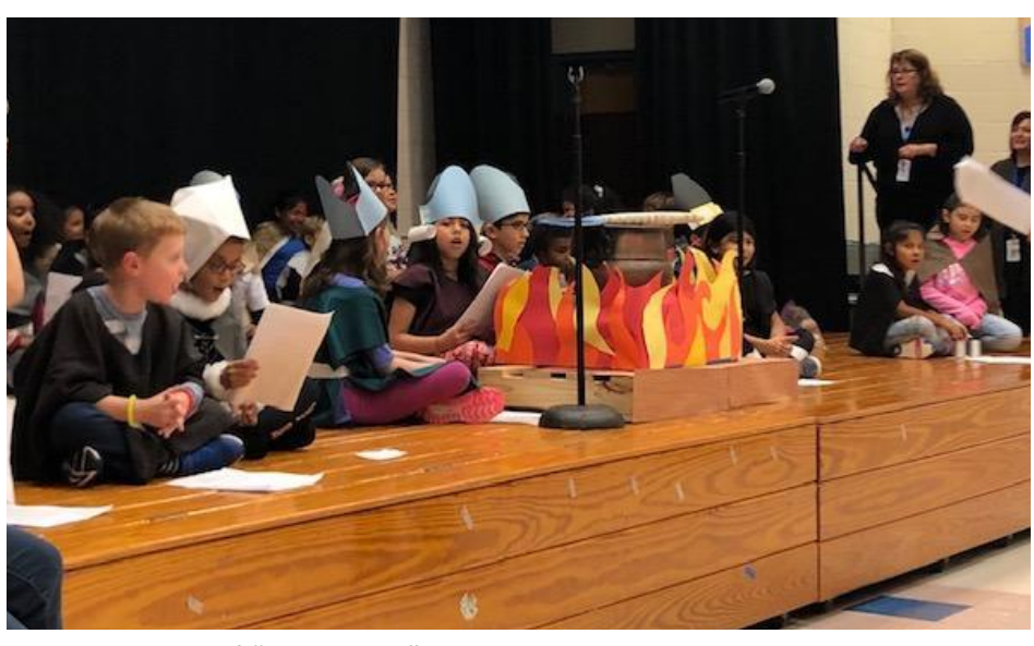
A presentation of "Stone Soup" by the second grade.

We would like to extend a heartfelt thank you to all who donated to our Barcroft Holiday Shop. Your support helped provide toys and coats to 50 Barcroft Elementary families who can use a little help this holiday season.