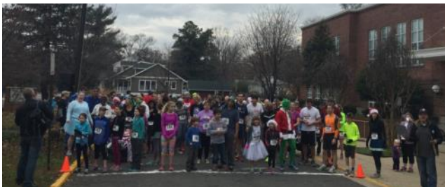
The first Snowball Stride was held December 12.

December was an exciting time for the school. The Winter Concert was held on December 8 and featured musical performances by the 4th and 5th Grade Chorus. Over 200 runners joined together with community members and volunteers on a sultry Saturday