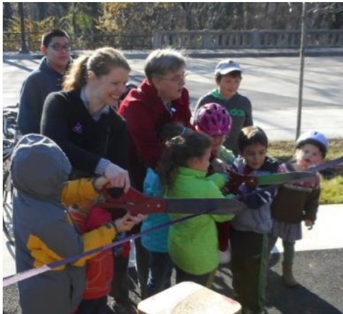
A ribbon-cutting ceremony was held at the new park adjacent to the Barcroft neighborhood on Saturday, December 5.