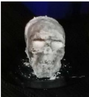
This skeleton head cake was delicious!